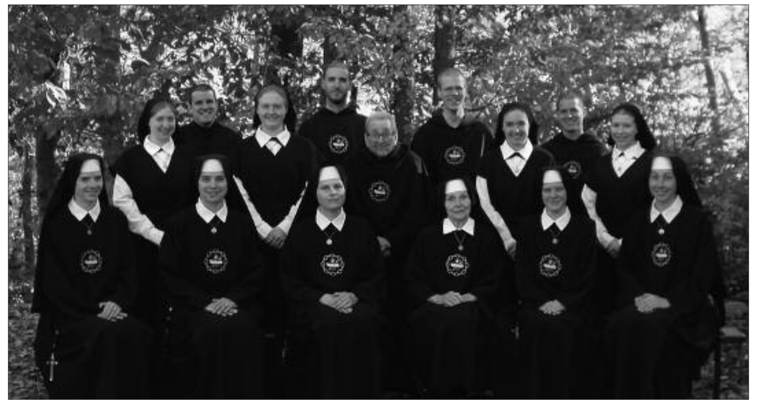
The Slaves of the Immaculate Heart of Mary

crease in religious vocations. The brothers and sisters are always receptive to communication with young people who are generous enough to test the highest calling first.