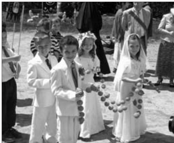
We had four First Holy Communions on the day of our May Crowning.

There is a tradition that the spice rosemary, taken from the needles of the rosemary bush, received its evergreen-like aroma after Our Lady hung the clothes of the Baby Jesus on its branches during the flight into Egypt.