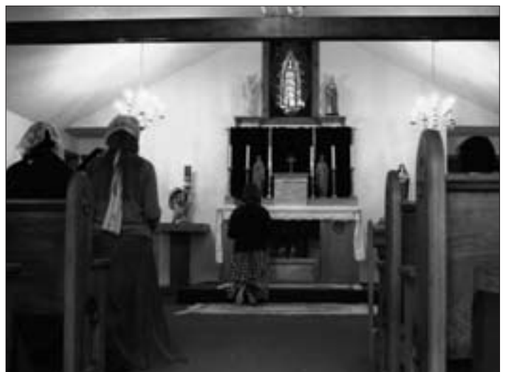
A view of the convent chapel during a Sursum Corda Society event.