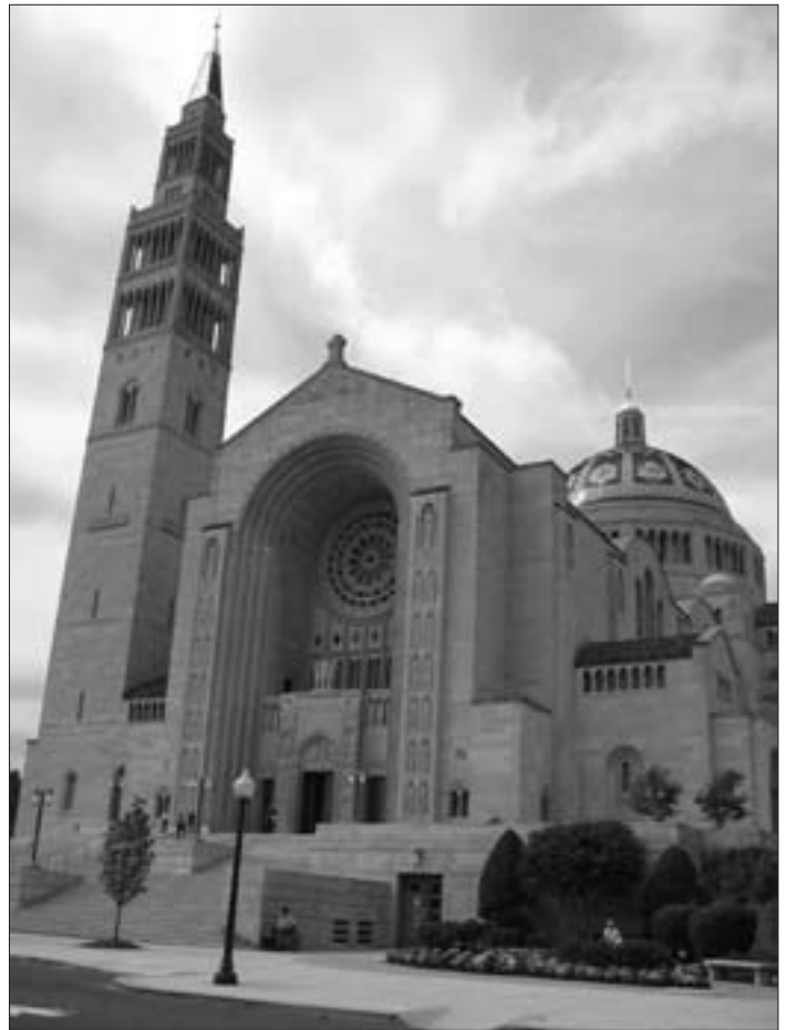
Our National Basilica in Washington, DC.