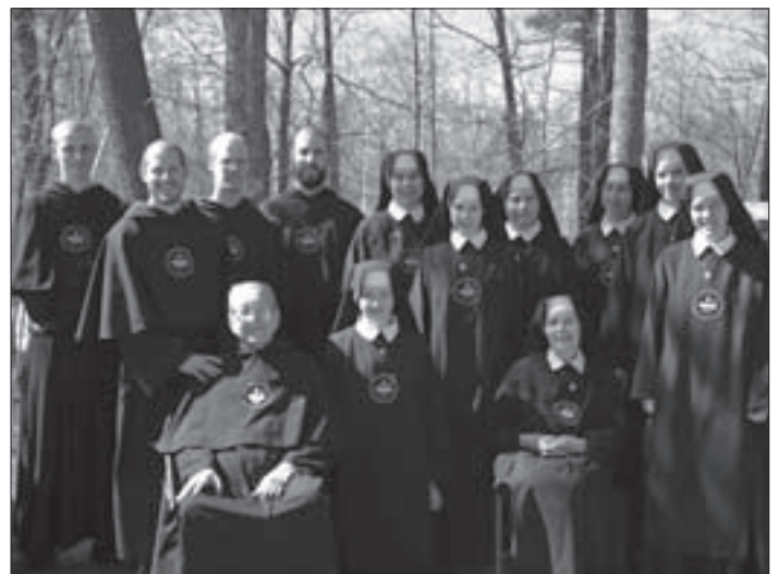
The Slaves of the Immaculate Heart of Mary on March 25, 2009.