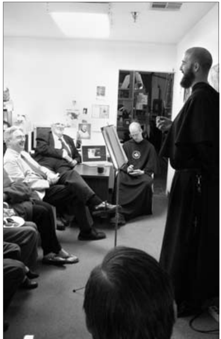
The Catholic America Tour at Catholic Treasures in southern CA.

Email Russell LaPlume at rlp@catholicism.org .