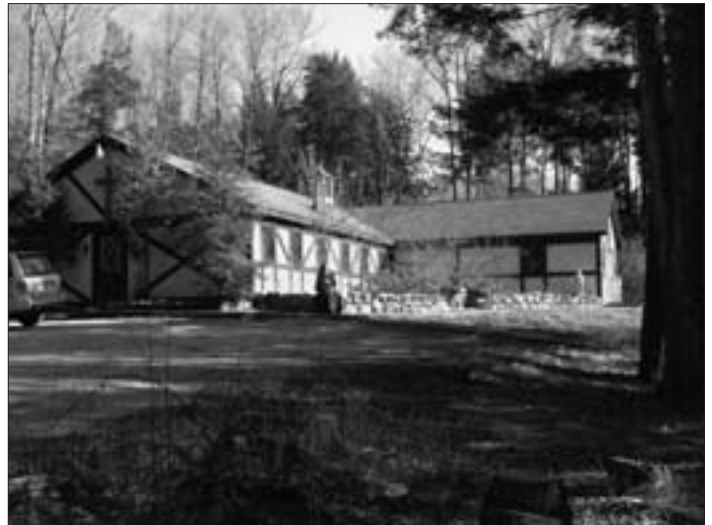
The newly donated Saint Philomena’s Convent.